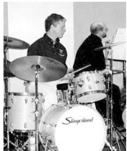
When playing and reading some types of music, such as jazz, a great amount of physical and mental coordination is required. (Author playing in a jazz band.)