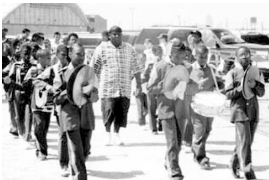
Marching requires a great amount of endurance—especially in hot environments for long periods of time. (Allen Elementary Percussion Ensemble, Houston, Texas)

3. WATCH YOURSELF AND MAKE CHANGES. Whether by use of a mirror,