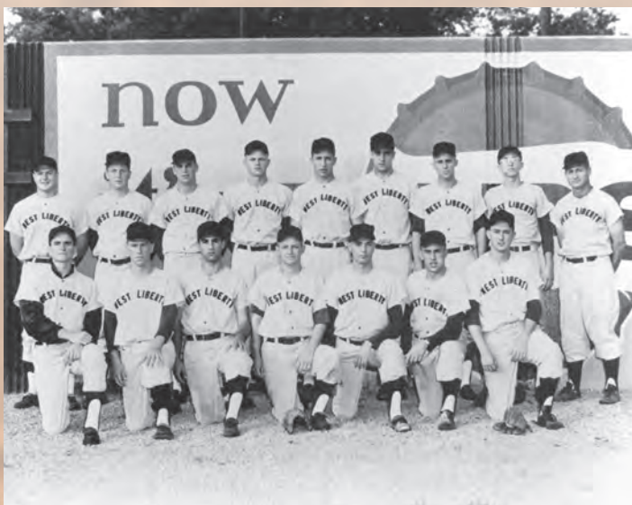
1964 NAIA World Series Champs: West Liberty University Baseball Team

It was the year that the Beatles made their debut on the Ed Sullivan Show, the Vietnam War raged and color television made its way into our homes.