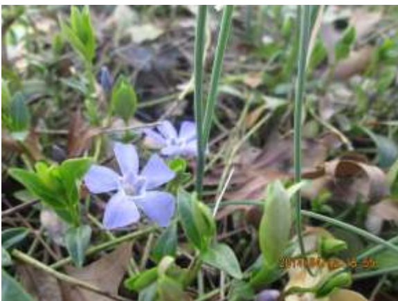
Taken near the International House

As a saying goes, "Life is not a lack of beauty, but the lack of observation", West Lib always makes you out of guard, especially the unexpected April snow.