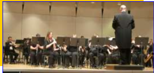
4. Music Concert (Wind Ensemble)