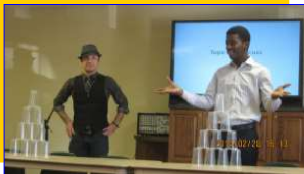
6. International Club Meeting ( Always fun to enjoy some games)