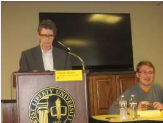
9. SGA Debate