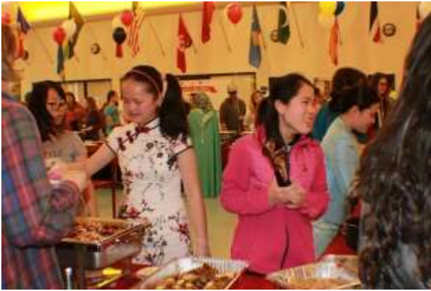
7. International Food Festival