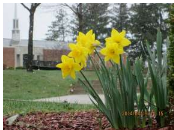
In front of the College Hall, you can even see the snow there when zoom out