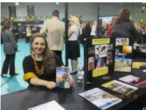
11. Spring Open House