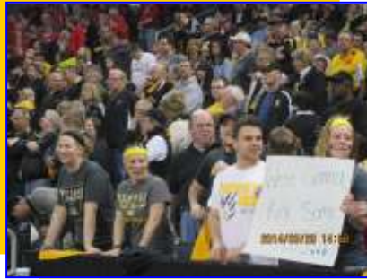
2. NCAA DII Groupies