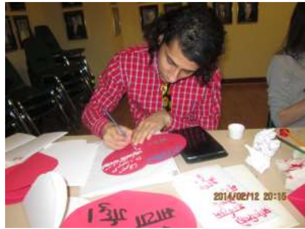
8. Language of Love