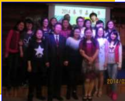
5. Chinese New Year Festival