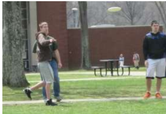
10. Frisbee Fun ( Quad )